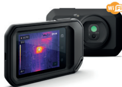
FLIR C3-X Compact Thermal Camera with Cloud Connectivity and Wi-Fi