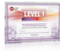
ITC Online Level I Thermography Course