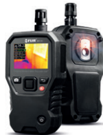
FLIR MR176 IGM ™ Moisture Meter with Replaceable Hygrometer