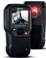
FLIR MR160 FLIR Imaging Moisture Meter