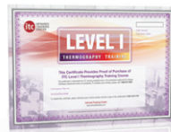
ITC in person training Level I Thermography Course