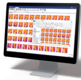
FLIR Thermal Studio Pro 1 year Subscription