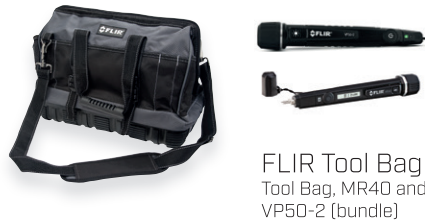
FLIR Tool Bag Tool Bag, MR40 and VP50-2 (bundle)