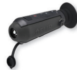
Scout TKx Thermal Imaging Monocular